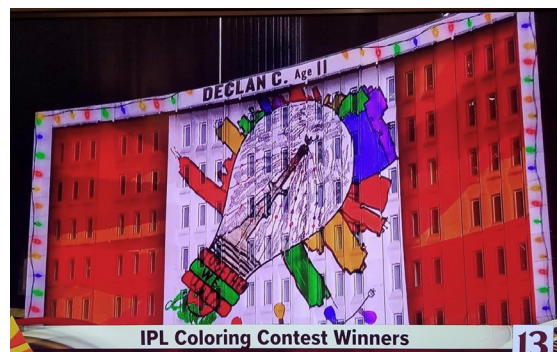
IPL Coloring Contest Winners