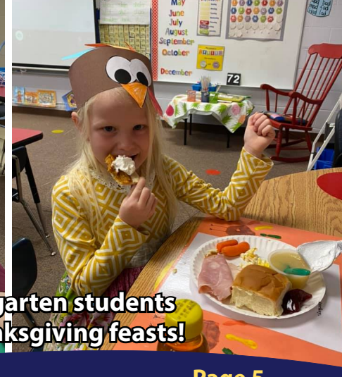
Waverly kindergarten students enjoy their Thanksgiving feasts!